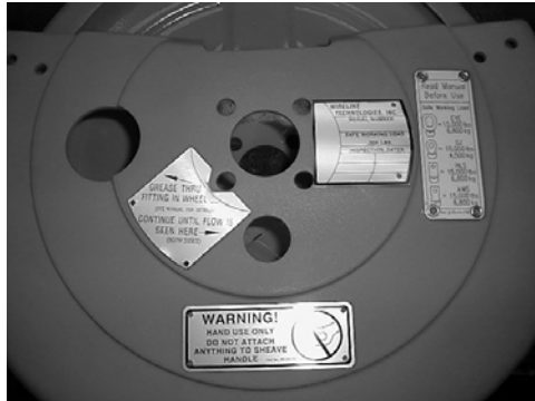
14" Sheave Part Number RS-14-1380 Figure 1

Safe working load tags are to be added to all sheaves, except those sold directly to Baker Atlas. The position of these tags is shown in the figures below. Install the tags with 1/8" aluminum rivets.