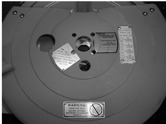
17" Sheave Part Number RS-17-1380 Figure 2